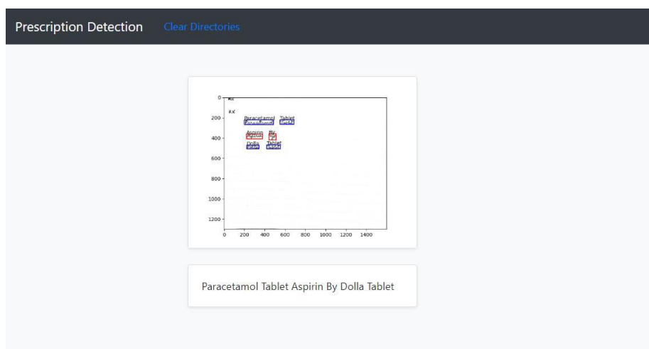
Figure 2: Word and digit recognition output

The output of our suggested solution shows a list of digitalized drug names in the input's intended sequential order. The composition, price, and usage of the medications are included in the digitalized medication list. There is also a list of comparable medications that are suggested depending on price. The system will be able to recognize individual words. It